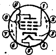
Base pin No.